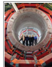
The completed solenoid inside the vacuum tank.