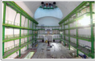
The start of the installation of the infrastructure in the experiment cavern.