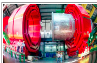
Iron yoke rings and the vacuum tank in the surface hall.