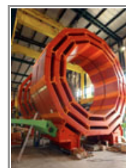
The iron return yoke rings: the surface hall begins to fill whilst work continues underground.