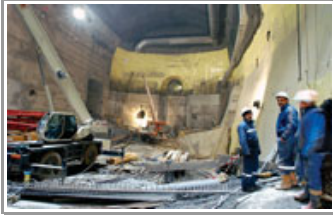
The floor of the experiment cavern under construction; the accelerator tunnel can be seen in top-centre.