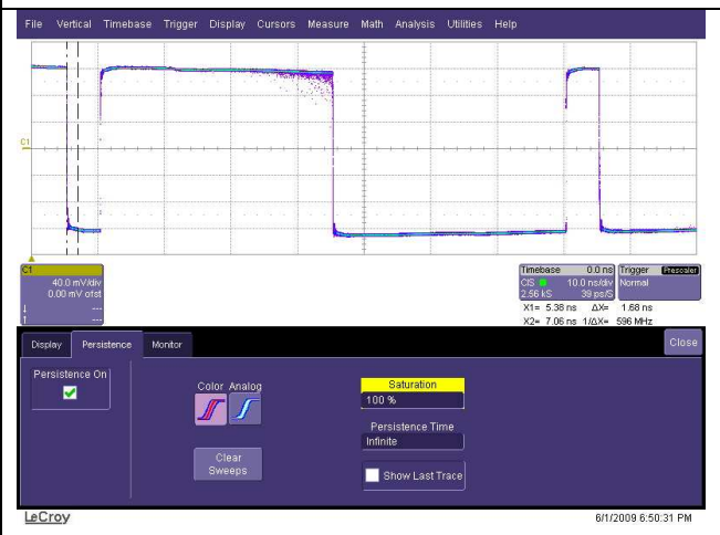
gbtia OUTN with User pattern (200 Mbit/s) DC current = 0.92 mA